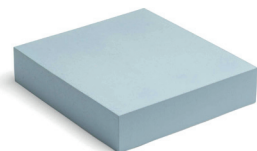
886.068 Block5 Headrest

FOR-MED is a development and manufacturing company, specialized in customized medical products for radiology, nuclear medicine and radiotherapy.